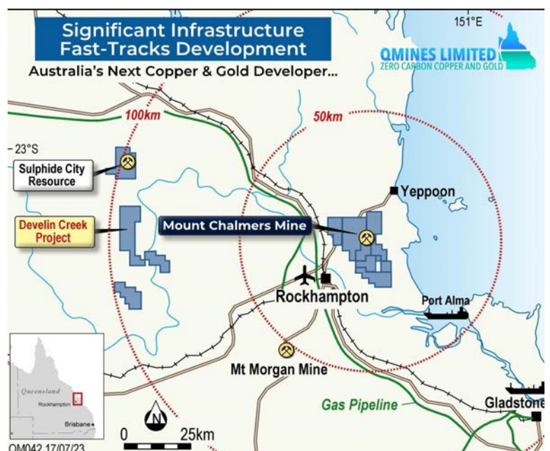
Figure 1: Mt Chalmers & Develin Creek project locations amongst regional infrastructure.

QMiners plans to complete infill drilling to improve resource confidence, step out drilling to assess the potential for a larger resource and development drilling comprising metallurgy and geotechnical drilling to determine the deposits suitability for potential future mining.